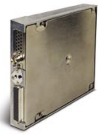
Garmin's GDL90 is a Universal Access Transceiver to support ADS-B.