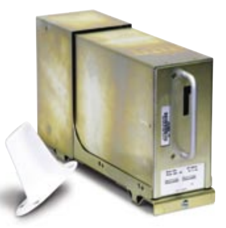
Garmin's GDL69 is an XM compatible weather receiver.

gives the pilot the ability to see the same secondary targets that the controller is presented with. This datalink however is limited to the service area as defined by the FAA deployed transceiver or in the case of TIS the Mode S ground stations. The effective range of the Mode S ground station is typically 60 miles. This information transfer actually yields better bearing accuracy to traffic then the TCAS system as its accuracy decreases with range. The pilot's aircraft must have GPS on board to provide not only aircraft position but also Flight ID, intent, altitude, track and turn reports, heading and speed. In essence then ATC knows exactly who you are and where you are going. With the current congestion in TIS-B it is more likely that another more common datalink be required, like the Universal Access Transceiver (UAT). Currently the UAT operates on a single frequency with a bandwidth of approximately 1.5 Mhz and no tuning is required by the user.