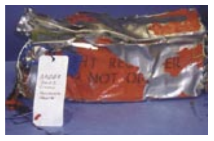
The damaged flight data recorder from EgyptAir Flight 990.

of gravity). Additionally, each must also survive flames at 2,000 degrees Fahrenheit for up to 30 minutes, and submersion in 20,000 feet of saltwater for 30 days. Most flight data recorders are constructed with an aluminum sheet metal chassis, with a protective capsule constructed of heat-treated stainless steel or titanium. Because new solid-state digital recorders have no moving parts and are smaller than their predecessors, they are lighter than analog tape devices, and use less power. In many accidents, the only devices that survive are the Crash Survivable Memory Units (CSMU) of the flight data recorders and cockpit voice recorders. Typically, the rest of the recorders' chassis and inner components are mangled. The CSMU is a large cylinder that bolts onto the flat portion of the recorder. This device is engineered to withstand extreme heat, violent crashes and tons of pressure. In older magnetic-tape recorders, the CSMU is inside a rectangular box.