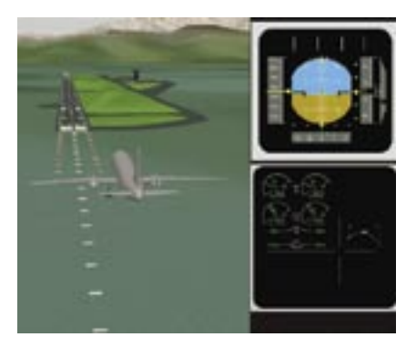
Aircraft animation snapshot with instrument panel and terrain elevation data.

Flight reconstruction consists of utilizing recorded flight data to derive the aircraft's instantaneous position and orientation relative to an orthogonal, right-handed Cartesian frame of reference that is fixed to the Earth. Several algorithms exist for calculating an aircraft's flight path, which require different sets of input parameters. The total set of parameters includes airspeed, pressure altitude, radio altitude, ground speed, drift angle, roll attitude,