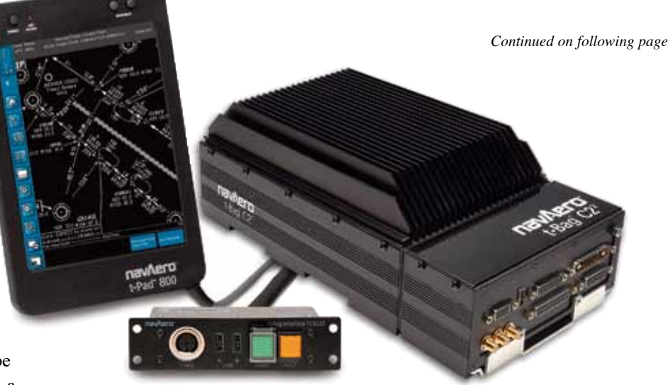
NavAero markets its t•Bag C2<sup>2</sup> EFB system as one of the "most cost-effective, robust and purposefully built Class 2 EFB systems available today."