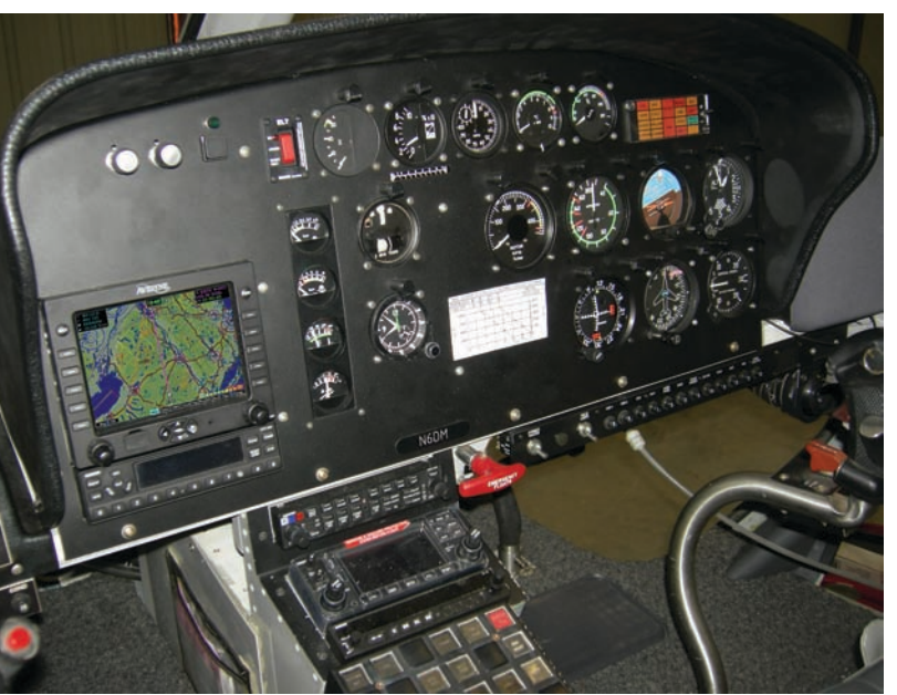
Vista Aviation's first Avidyne EX600 installation in an A Star 350B helicopter.

When customers brought in radios requesting they be repaired, Rhodes cobbled together a homemade shop bench from a door and two-by-fours. An aircraft battery provided power, while alligator clip leads served as a makeshift test harness.