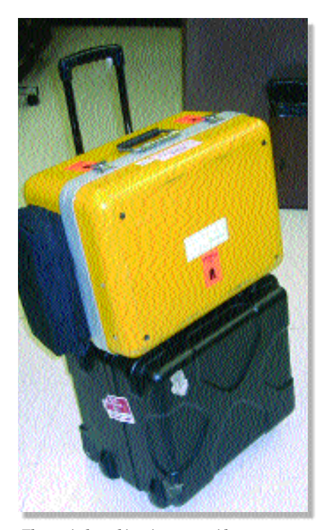
The static hose kit suitcase provides a convenient way to wheel out the tester for the attack.

Section 9.b. of the Advisory Circular talks about the damage that can be done to instruments that are connected to both the pitot and static systems when only one system is evacuated. This can cause the differential pressure design limits of such instruments to be exceeded. As the Circular says, if you tie both the pitot and static systems together, then you will have zero differential pressure regardless of the amount of static system evacuation. In complex aircraft with dual pitot and static systems, there is always the worry that an aftermarket air data device may be connected to the pilot's pitot and the copilot's static. In this case, you would backpressure or exceed the device limits even if you tie the pilot's pitot and static together since the copilot's side