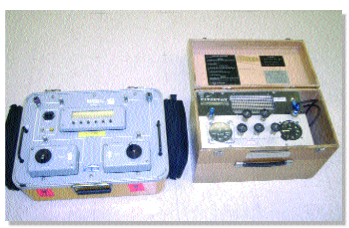
New RVSM tester on left, old reliable on the right.

them. Routing the hoses under the aircraft belly as much as practicable will help prevent all but the shortest midgets from tripping.