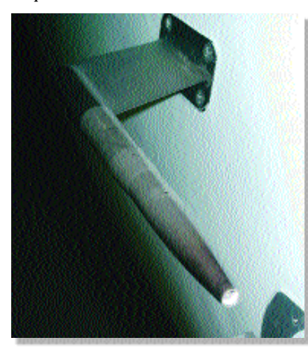
Close up of combined pitot-static tube

experience must prevail to ensure that a cabin pressure gage or hidden airspeed sensor is not damaged or backpressured while performing the checks required.