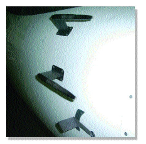
Both pitot tubes contain two static ports. Another pitot tube with dual static ports is on the pilot's side as well.

There are two primary ways to perform altimeter checks. In the past, it was normal to remove the altimeters and send them to an instrument shop. After receipt of the certified altimeters from the instrument shop, the system was leak checked and the inspection was signed off. In recent years, the testing of the altimeters and encoders while still installed in the aircraft has become the norm. This can be tricky since many older aircraft come from the days when this was not the common practice and there may not be instructions in the maintenance manual for the step-by-step performance of these checks. Common sense and