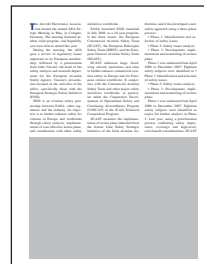
1/2 PAGE HORIZONTAL