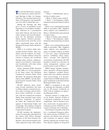
1/3 PAGE VERTICAL