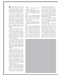
1/3 PAGE SQUARE