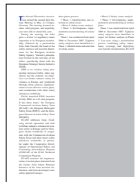
1/2 PAGE VERTICAL